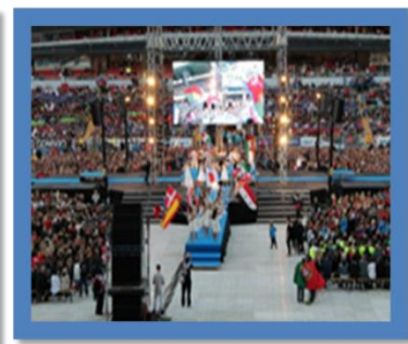
Gothia Cup Opening Ceremony