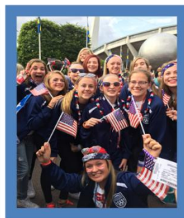
Norco Soccer Club