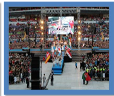
Gothia Cup Opening Ceremony