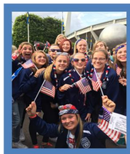
Norco Soccer Club