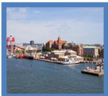
City of Gothenburg